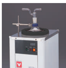
Glass condenser set